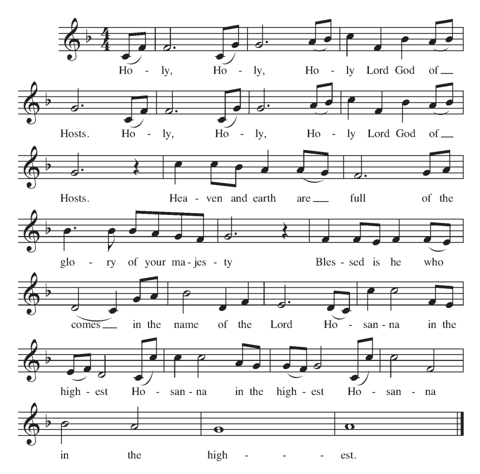
Celebrant: Holy and gracious Father... Therefore we proclaim the mystery of faith:

Therefore we praise you, joining our voices with Angels and Archangels and with all the company of heaven, who forever sing this hymn to proclaim the glory of your Name: