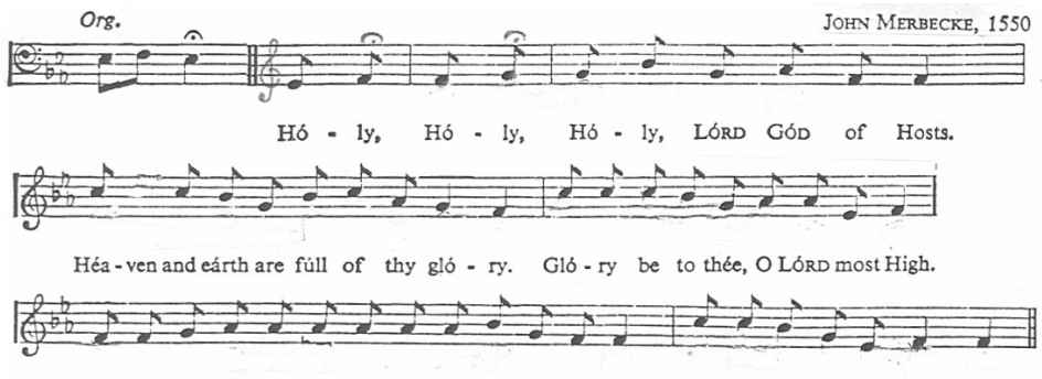
Bless-ed is he that com-eth in the Name of the LORD. Ho - san-na in the high - est.

Therefore we praise you, joining our voices with Angels and Archangels and with all the company of heaven, who forever sing this hymn to proclaim the glory of your Name: