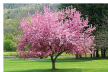
Flourishing November 24

A collaborative offering of Church of the Cross, Church of the Redeemer, Restoration Anglican