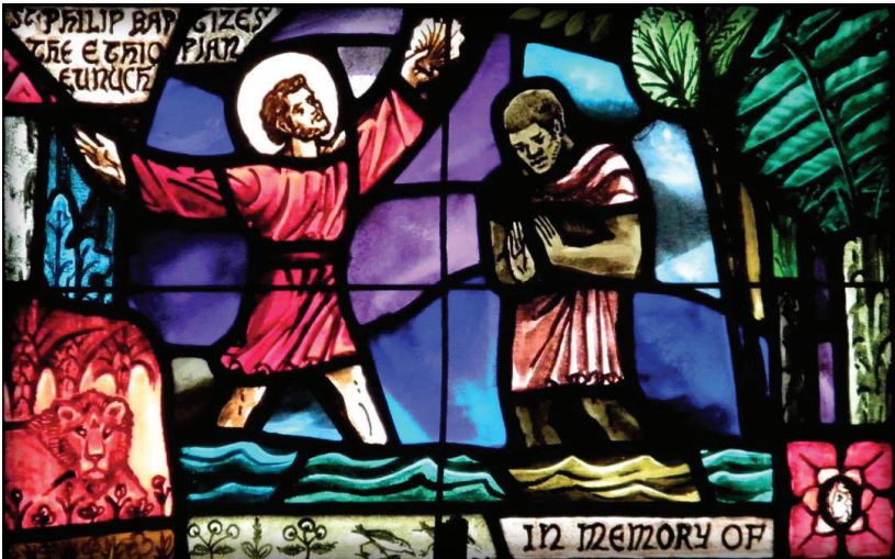
Apostles Windows - St. John's - Grace Episcopal Church, Buffalo, NY

Kids of the Redeemer reflection activity: